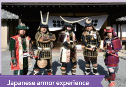
Japanese armor experience