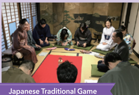
Japanese Traditional Game